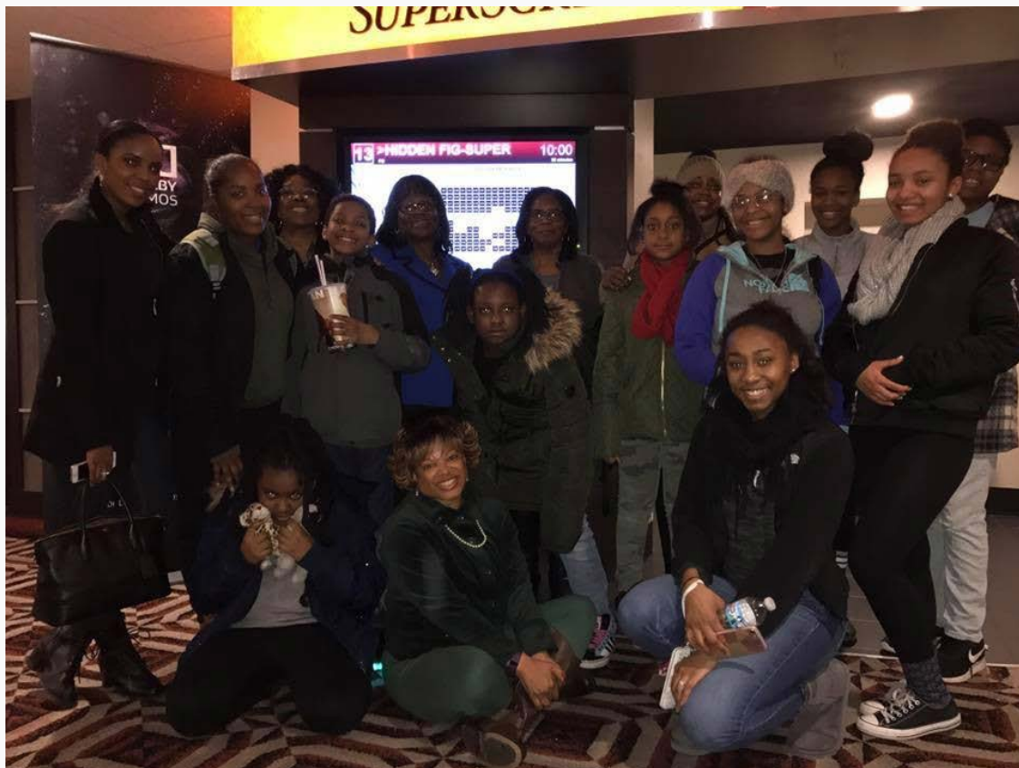
The North Shore branch members took their JADES (youth) to the Marcus Cinemas to