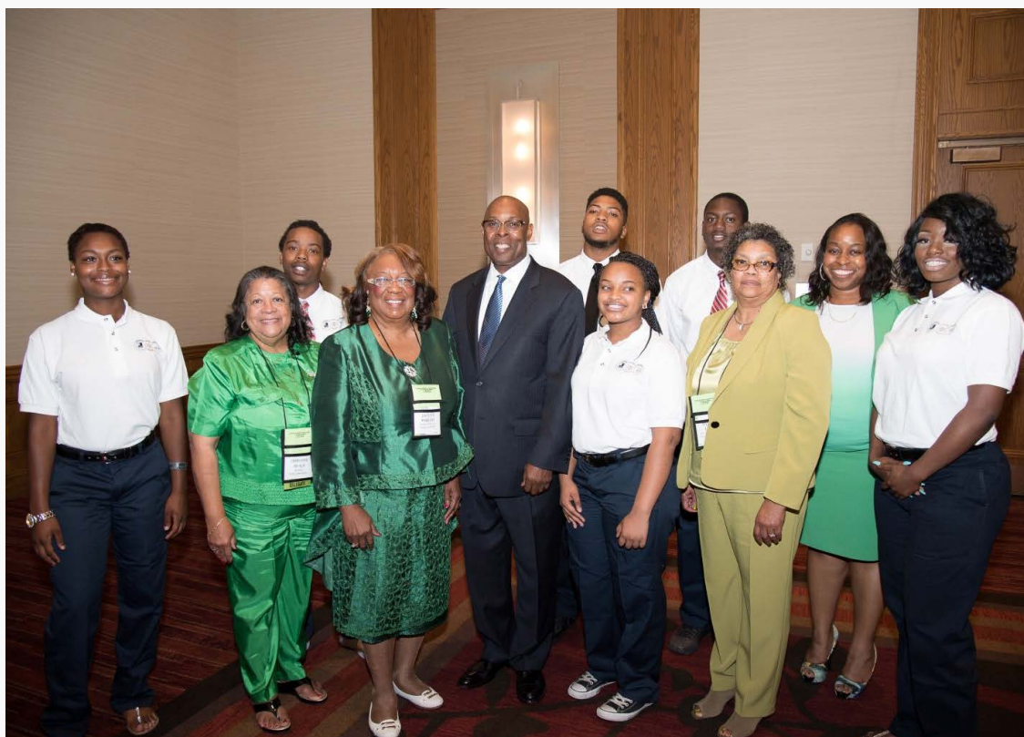
Youth Luncheon-Innovative Concept Academy