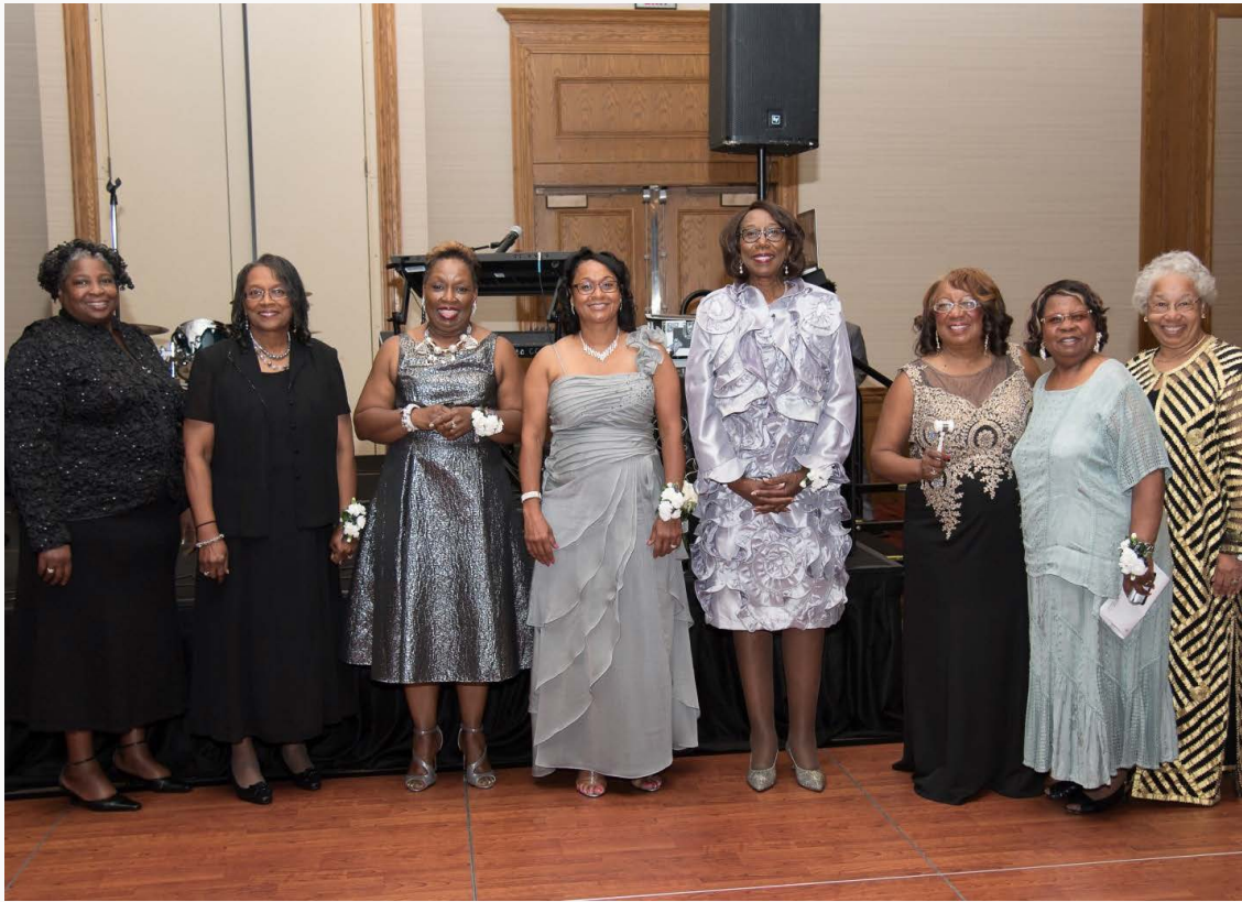
Installation of Officers