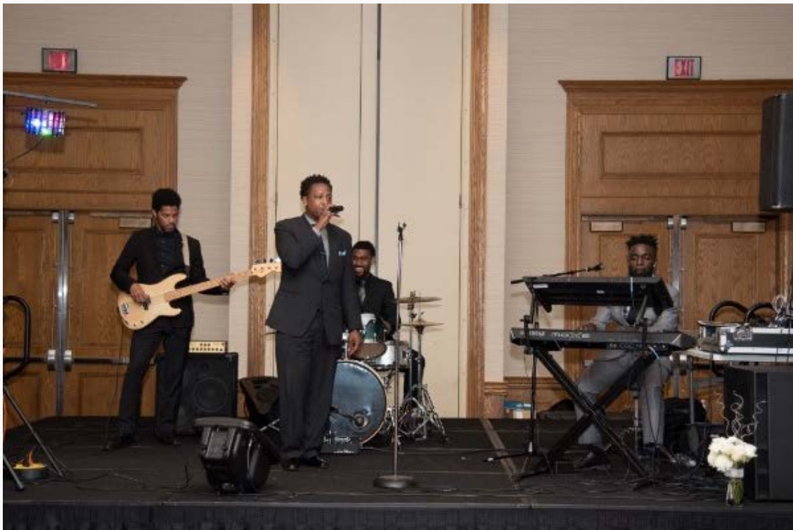
Evening of Elegance Band